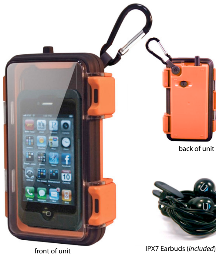
front of unit